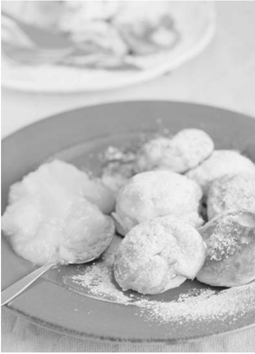
A Danish aebleskiver dessert with applesauce and small pancakes.